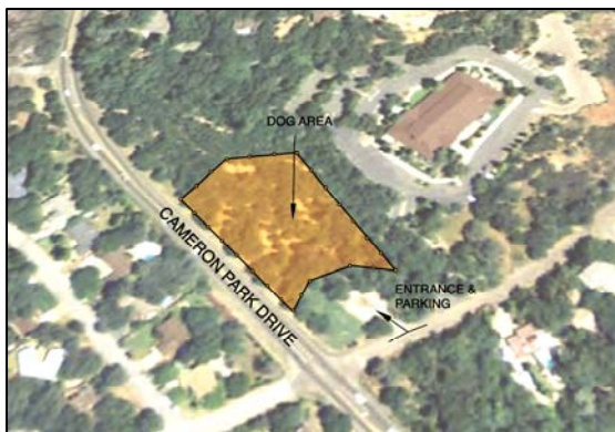
Future home of your off-leash dog park in Cameron Park

Once we satisfy all the legalities, the Grand Opening date will be driven by how quickly we can raise the funds needed to actually build the park.